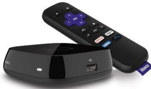
Pictured Below: Standard Roku Unit

There are two external devices that represent the easiest (and least expensive) way to watch Internet television on your regular TV: Amazon Fire TV and Roku . You simply plug these devices into your TV's HDMI port. Most TVs manufactured since the mid 2000's will have HDMI ports. If not, you can even plug in with the old style composite cables (the same cables that are used to connect a VCR). After your device is plugged in to your TV, then follow the instructions and connect it to your home Wi-Fi network (wireless). You need not be a sophisticated computer programmer to set one of these up - it is very simple and takes less than five minutes (no kidding). I should also note that newer TV's are coming with similar services already built directly into the unit. I was really amazed recently to notice that some of these so called ' smart TVs are available for under $250 '. So, if you are in the market to upgrade your TV, you can really save some money by purchasing a unit with Roku already built in. There are other, more expensive plug-in boxes such as Apple TV. There are also ways to use gaming units to watch Internet TV, but for this E- Book I am sticking to the two hardware devices that are the most affordable and best value for the money.